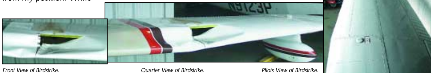
Front View of Birdstrike.