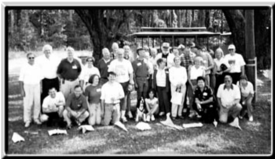
SAAPA 2000 Olympic Athletes standing in back of their "Home-Built" Aircraft

Please be sure to use the services of these fine organizations and to thank them for supporting SAAPA.